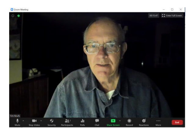
Live Chat is optional.